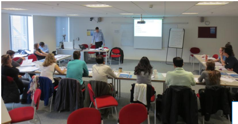
New Lecturer attendees at the workshop in Manchester

In fact, as a result of the workshop I have already used some games and experiments in my Economics of Strategy classes. After the discussions about the issue of quality feedback provision, I have implemented two sets of formative assessment and a rubric system for marking for this (Economics of Strategy) and other modules. I am now planning to record video-clips and podcasts to convey complex messages and material to students, which was successfully implemented at the hosting institution (Manchester) and resulted in very positive student feedback. In addition, I have decided to follow another example of good practice, namely to plan my lectures and tutorials more formally by designing and following worksheets.